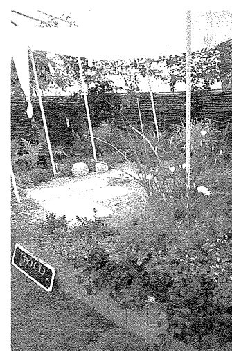
Above: A Moment in Time — this Bell Gully-sponsored garden captures soft, wispy summery tones