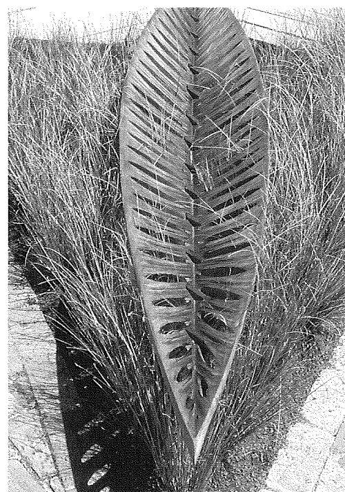
Above: Joy Plants (Auckland) featured 'Grandad went to Africa', a book owner Terry Hatch launched at the show. The garden was full of New Zealand and African species used in new, novel and delightful ways