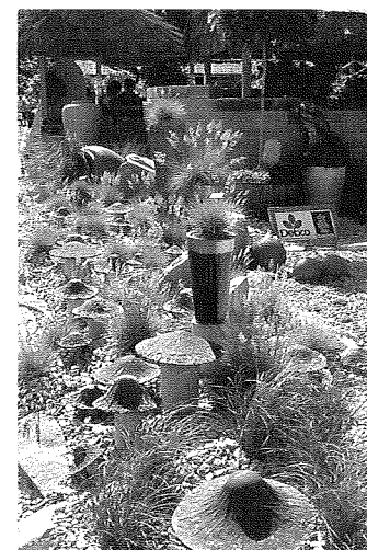
Below: Mushrooms, grasses 'n groundcovers made a stunning statement in the afternoon sun. Petals 'n Pots with Debco featured in Awards for this effort